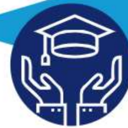
Right Study Environment