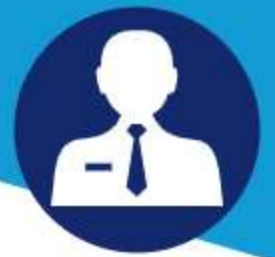
Right Skills Development

CADDEX is a companionship of Civil Engineers & Architects formed with a motto of imparting value added competency skills enhancement training to the construction personnel, students and faculties at all levels to transform them into professionals.